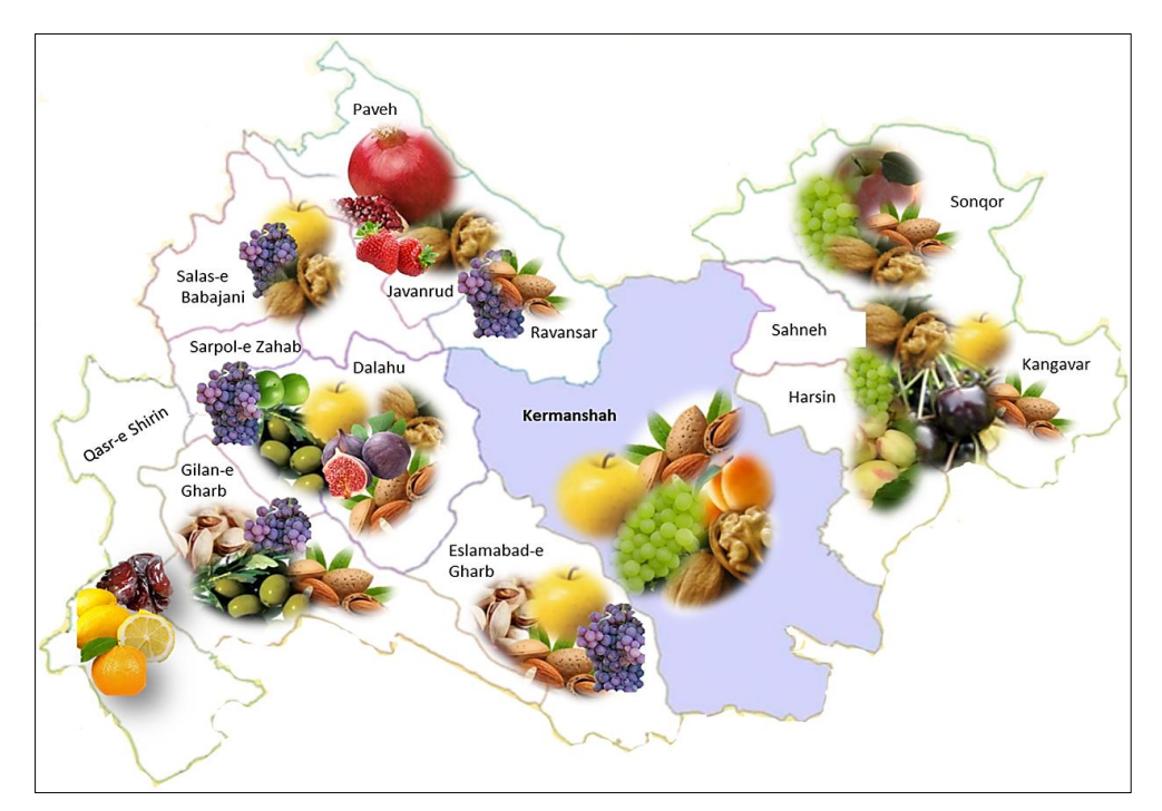
Fig. 1. Fruits map of Kermanshah province highlights diverse species of fruit production.

Kermanshah province with an ancient history in terms of habitation and agriculture as well as an area of about 25,000 km<sup>2</sup> has an area of 40,000 hectares of fruit orchards. The average annual production of these orchards is about 250,000 tons (Carfagna and Gallego, 2005), which this average production is very low. In terms of geographical location, Kermanshah province is located in the middle of the western part of Iran (34°18′N 47°4′E), having diverse climates has caused this province to become the land of the four seasons and almost important cultivars of fruit trees such as temperate fruits, nut fruits, small fruits and tropical and subtropical fruits are cultivated and produced across the province. Fig. 1 clearly shows the diversity of fruit species produced in Kermanshah province.